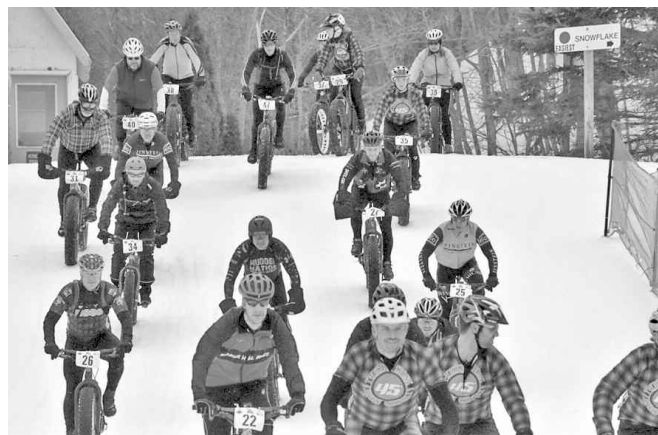
Riders aboard fat tire bicycles will compete along a nearly 2-mile loop across the trails at Mt. McSauba and the North Point Nature Preserve.

What a great way to spend the afternoon in the north...bring the entire family! The 5th annual Dogman Challenge Fat Bike Race is hosted by Revolution Bike in