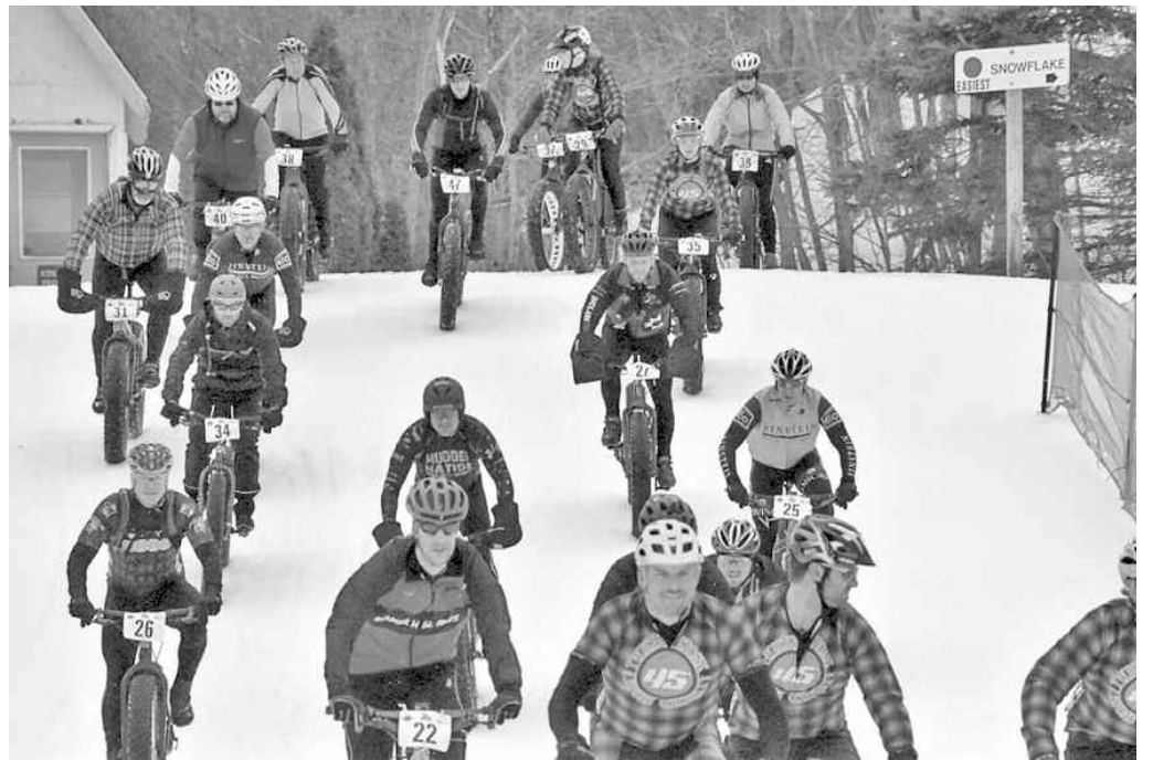
And they're off! The 5th annual Dogman Challenge Fat Bike Race is set for next Saturday, February 25. The event will kick off with a mass start at noon on top of the bunny hill at Mt McSauba in Charlevoix.

Competitors at the Dogman Challenge vie to complete the most laps in a two-hour period. Top placers will receive the coveted Dogman medal as well as cash prizes. Awards will be presented to 1st, 2nd and 3rd place finishers in Expert and Sport classes for both men and women. The awards ceremony will take place at the Lake Charlevoix Brewing Company starting at 4pm, and all are invited to attend.