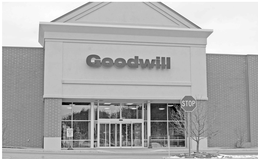
Goodwill Retail and Donations Centers are located throughout Northern Michigan, including this location in Petoskey.

Goodwill Northern Michigan serves 19 counties with nine locations, strengthening communities through programs such as Patriot Place transitional housing and resources for homeless military veterans, the Goodwill Inn emergency shelter for individuals and families and the Workers on Wheels programs. Workers on Wheels (WoW) pairs low income, hard working families in need with a safe, reliable donated vehicle at little or no cost to the family. Being able to get to work in a reliable dependable vehicle strengthens family independence and community involvement. Last year, 50% of WoW recipients reported increased earnings from picking up more hours or landing a better job through reliable transportation. Seventy-nine percent of car recipients reported that their kids had an increase in extracurricular